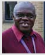
Dr. John Sentamu Archbishop of York

“We should all be very proud today that we can stand up and say Yorkshire is a beacon, lighting the way forward for the rest of our nation, on issues of fair pay. When we see unfairness and suffering we have a duty to step in and intervene with love, generosity and kindness. Not because it is the right thing to do, but because we have a moral obligation to do so. Fairtrade is not simply about generosity, it is about justice.”