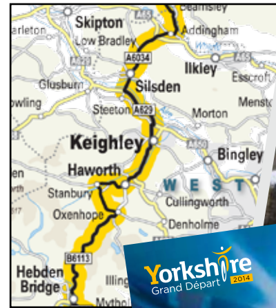
Detail of Stage 2 TDF2014 route through Worth & Aire Valleys, West Yorkshire.

To advertise call Karen or Liz on 01535 642227