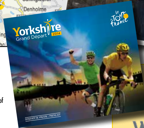
Map & photo courtesy of www.letour.fr